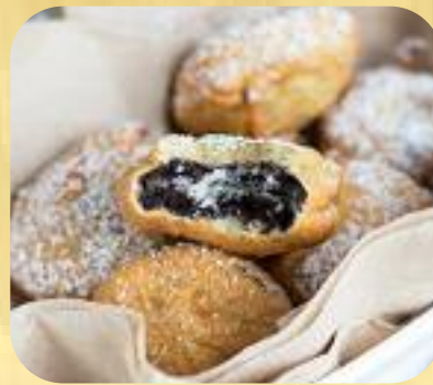
Ala Mode 1.99 Extra